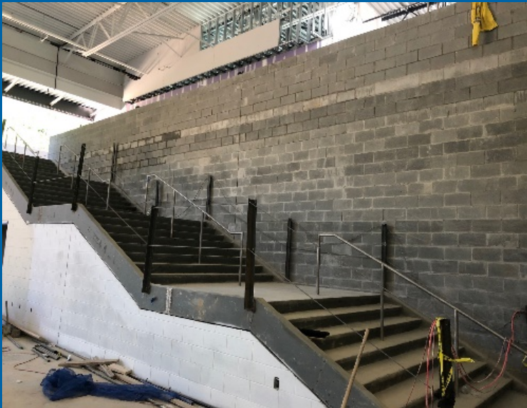
Gymnasium Stair Wall Complete