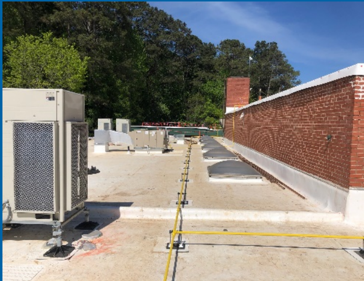
Gas Piping Complete on Roof