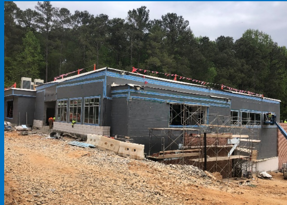
Gymnasium Southeast Elevation Progress