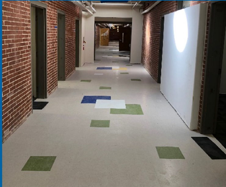
SW Wing VCT Installed in Corridor