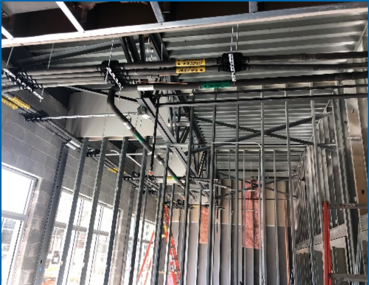
Gymnasium OH Rough