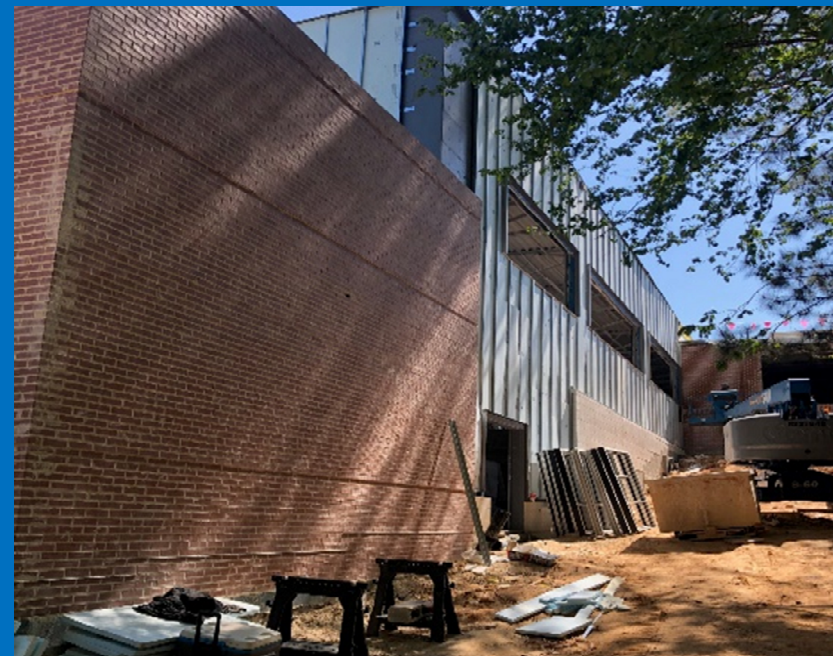
Gymnasium West Elevation Progress